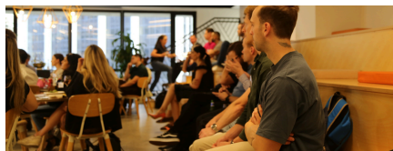
Beyond sponsorship, we host a number of industry and specialisation events each quarter to give back to the community.