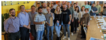
Sponsors and hosts the Brisbane Mobile App Developers Meetup.