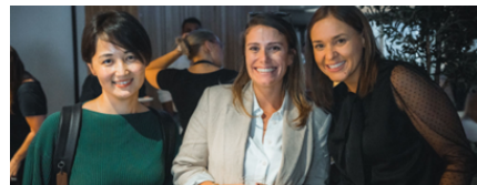
Appointed Chapter Leads at the Australian Women in Security Network (AWSN) and hosting monthly events.