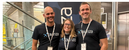
We are lead sponsor for Bsides Sydney, the largest Cyber Security event in NSW.